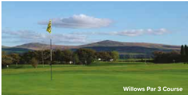
Willows Par 3 Course

Boasting fantastic views across Dartmoor, Oakwood is very much a thinking golfers course with well positioned ponds and bunkers providing the challenge of 'risk / reward' golf.